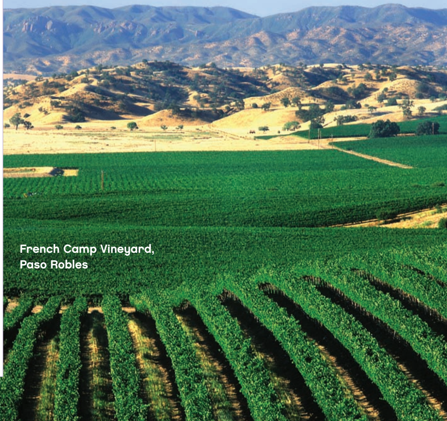
French Camp Vineyard, Paso Robles